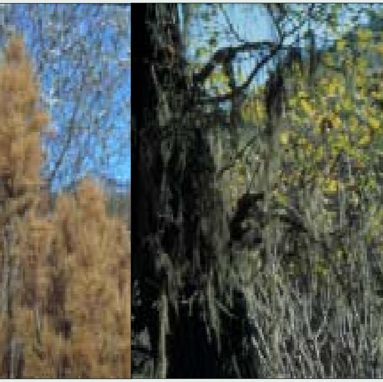
fishing, nature study and wildlife viewing.