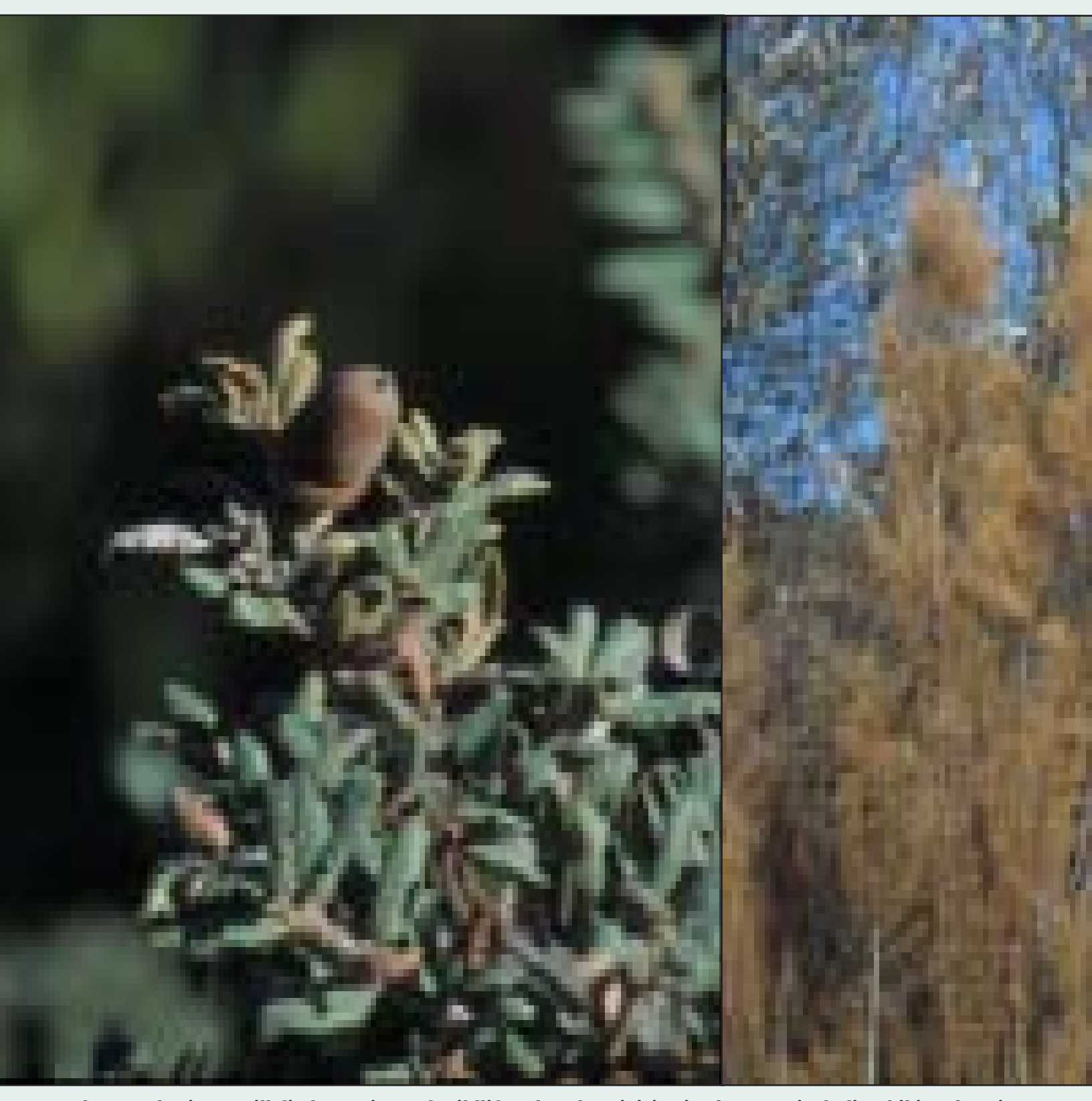
Outdoor enthusiasts will find a variety of wildlife-related activities in the area, including hiking, hunting,

as a Wilderness Study Area and Area of Critical Environmental Concern in an effort to protect the area's botanical values and wildlife habitat.