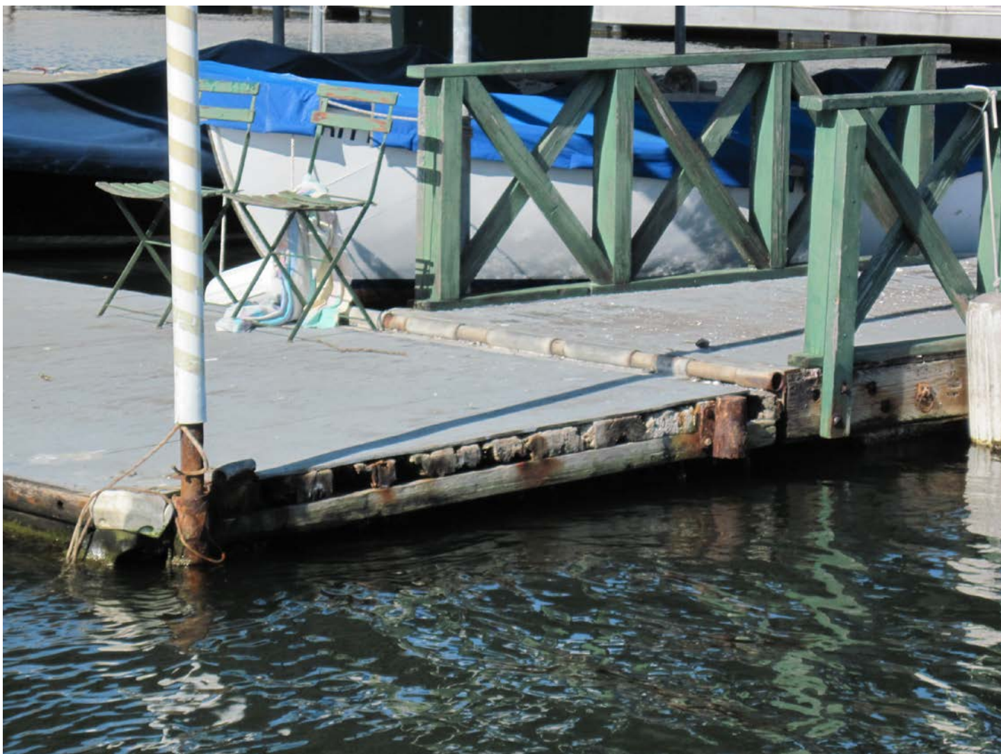
Photograph 3: Old whaleboat single tie dock, showing the rotten boards at the end of the dock. Picture taken before project.