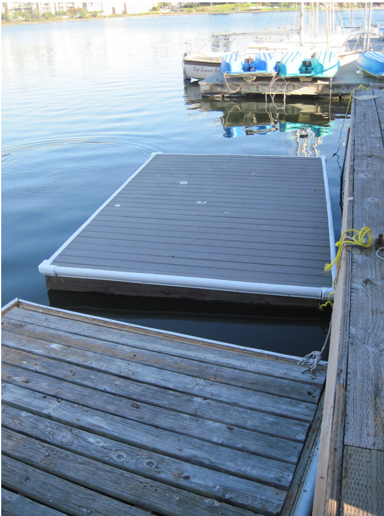
Photograph 6: New whaleboat single tie dock (background) shown next to an old dock (foreground). Picture taken after project.