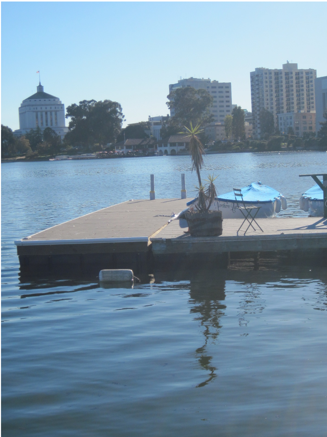
Photograph 4: New dragonboat dock (Note: new dock is on the left). Picture taken after project.