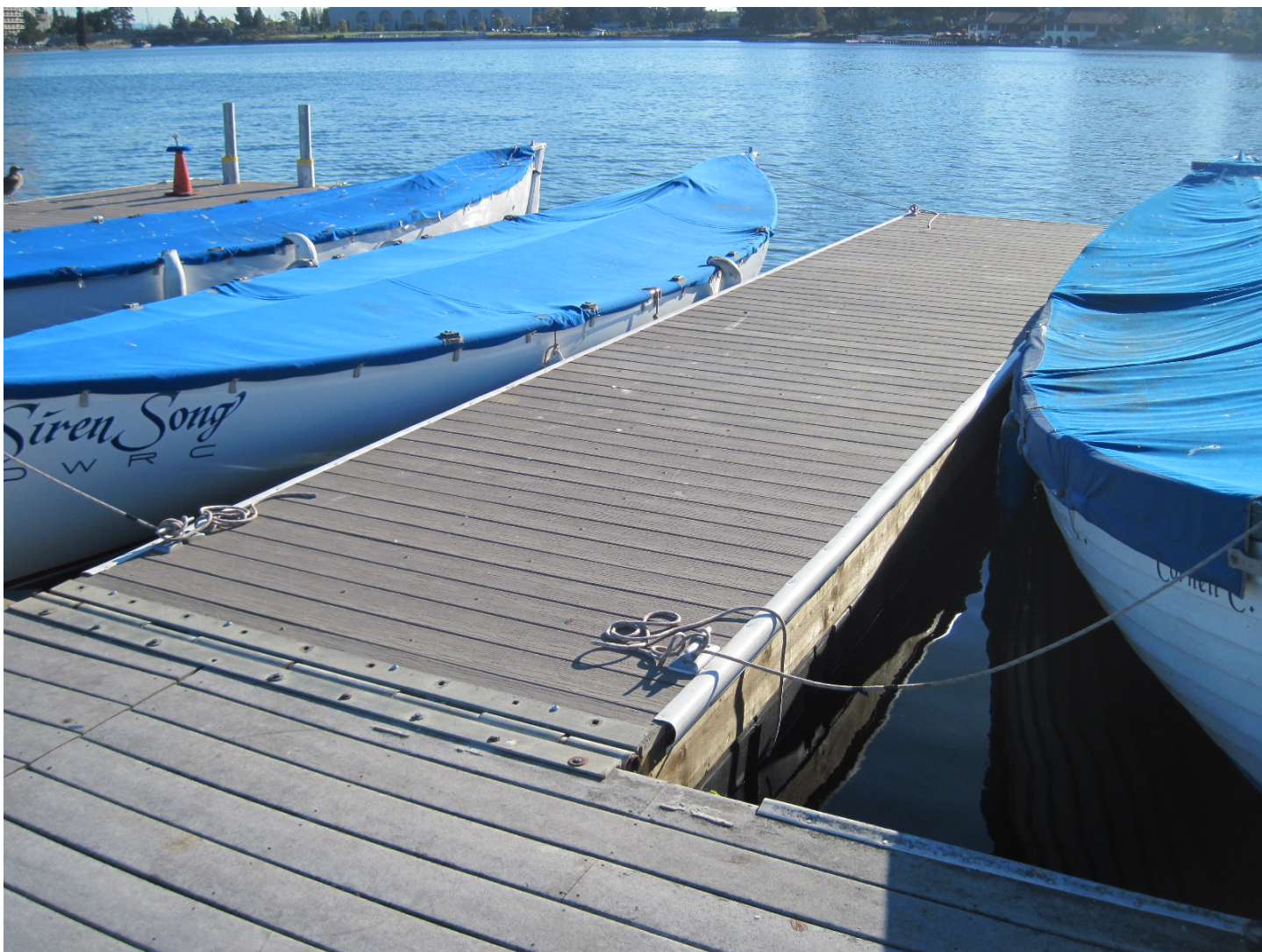
Photograph 5: New whaleboat finger dock (Note: new dock is between the two whaleboats). Picture taken after project.