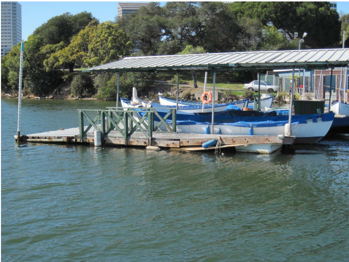
Photograph 1: Old dragonboat dock, showing the bare Styrofoam float of the old dock. Picture taken before project.