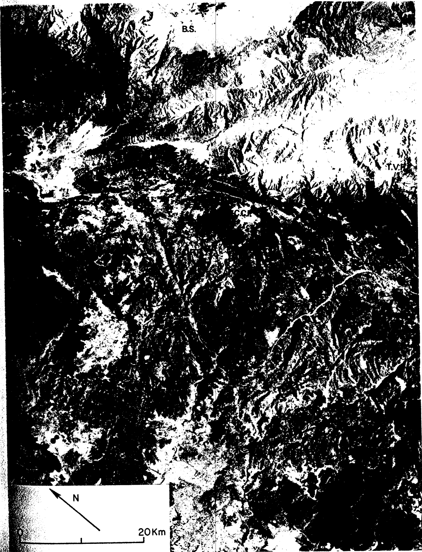
Fig. 3 - Portion of Skylab 3, September 1973, Frame 87-111, 190B camera image southwest of Borrego Springs. See Fig. 1 for area covered. Abbreviations: B.S.: Borrego Springs; C.C.F.: Chariot Canyon fault; O.M.F.: Otay Mountain fault; S.D.R.F.: San Diego River fault; T.V.F.: Thing Valley fault.