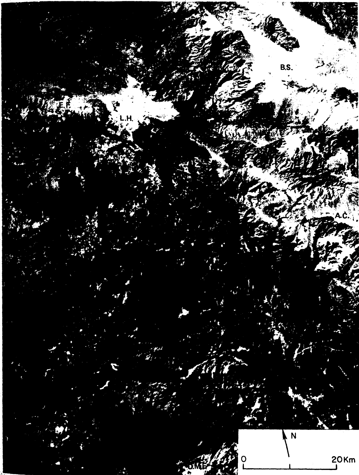
Fig. 4 - Western portion of ERTS image 1106-17504, November 6, 1972, between Borrego Springs and San Diego. Abbreviations: A.C.: Agua Caliente Hot Springs; B.S.: Borrego Springs; C.C.F.: Chariot Canyon fault; E.F.: Elsinore fault; L.H.: Lake Henshaw; O.M.F.: Otay Mountain fault; S.D.: San Diego; S.D.R.F.: San Diego River fault; T.V.F.: Thing Valley fault. See Fig. 1 for area covered.