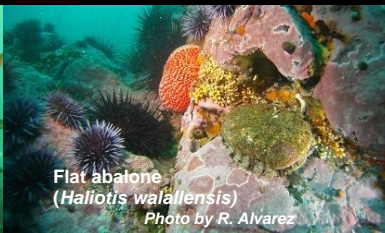
Flat abalone ( Haliotis walallensis )