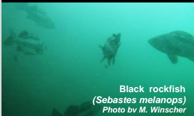
Black rockfish ( Sebastes melanops )

Northern California Marine Protected Areas (MPAs), Implemented December 2012