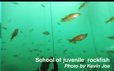
School of juvenile rockfish