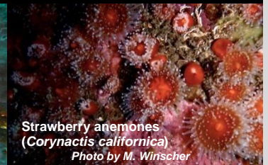
Strawberry anemones ( Corynactis californica )