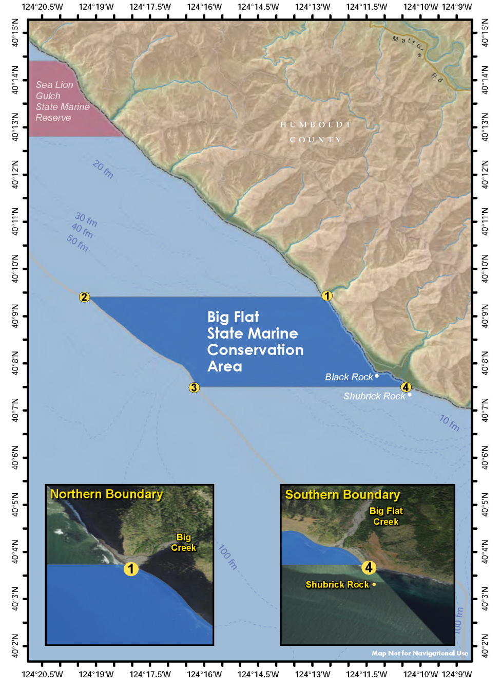
Big Flat State Marine Conservation Area Boundary and Regulations from California Code of Regulations Title 14, Section 632