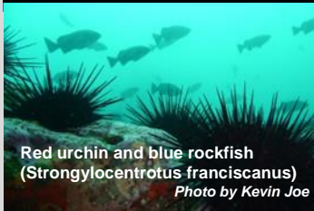
Red urchin and blue rockfish ( Strongylocentrotus franciscanus )

Northern California Marine Protected Areas (MPAs), Implemented December 2012