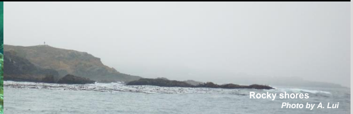
Rocky shores