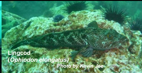
Lingcod ( Ophiodon elongatus )