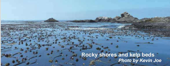
Rocky shores and kelp beds

Northern California Marine Protected Areas (MPAs), Implemented December 2012