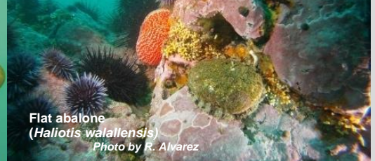
Flat abalone ( Haliotis walallensis )