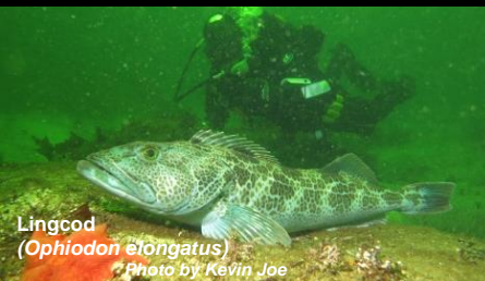
Lingcod ( Ophiodon elongatus )