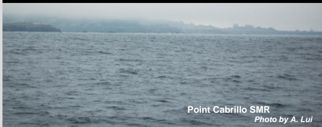
Point Cabrillo SMR

Northern California Marine Protected Areas (MPAs), Implemented December 2012