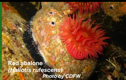
Red abalone ( Haliotis rufescens )