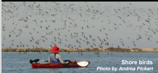
Shore birds

Northern California Marine Protected Areas (MPAs), Implemented December 2012