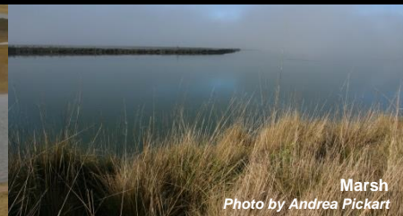
Marsh