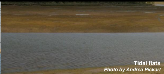
Tidal flats