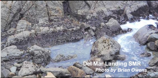
Del Mar Landing SMR

North Central California Marine Protected Areas (MPAs), Established May 2010