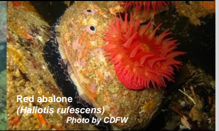
Red abalone ( Haliotis rufescens )