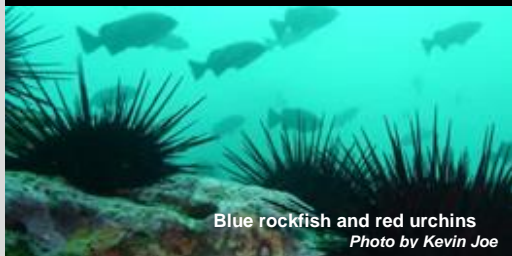
Blue rockfish and red urchins

North Central California Marine Protected Areas (MPAs), Established May 2010