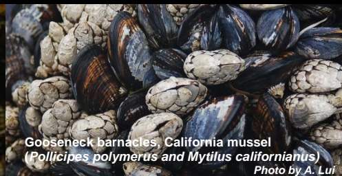
Gooseneck barnacles, California mussel ( Pollicipes polymerus and Mytilus californianus )