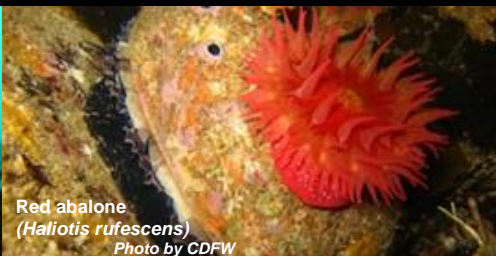
Red abalone ( Haliotis rufescens )