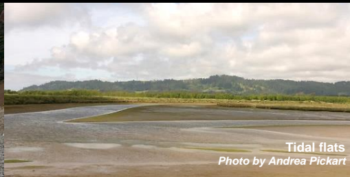
Tidal flats