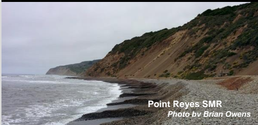
Point Reyes SMR

North Central California Marine Protected Areas (MPAs), Established May 2010