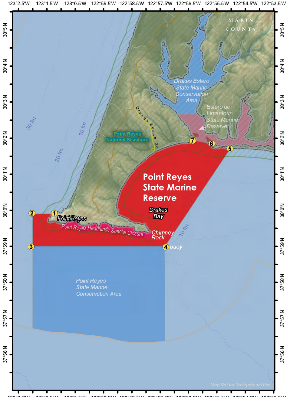
123°2.5'W 123°1.5'W 123°0.5'W 122°59.5'W 122°58.5'W 122°57.5'W 122°56.5'W 122°55.5'W 122°54.5'W 122°53.5'W Version 2, September 2022