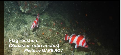
Flag rockfish ( Sebastes rubrivinctus )