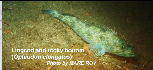
Lingcod and rocky bottom ( Ophiodon elongatus )