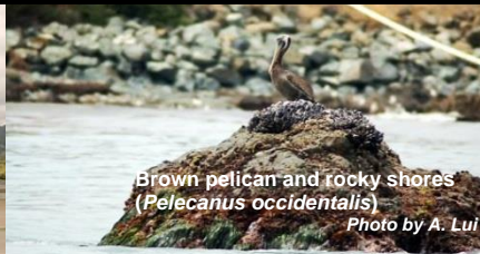
Brown pelican and rocky shores ( Pelecanus occidentalis )