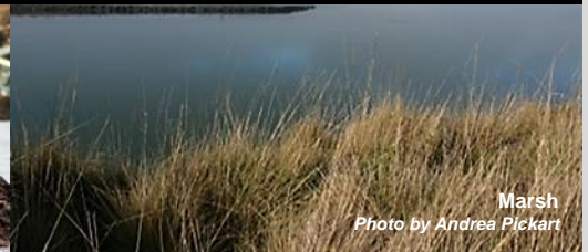
Marsh