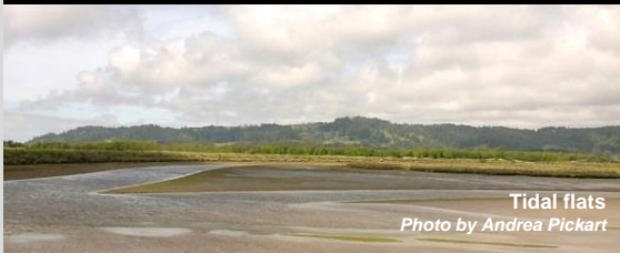
Tidal flats

North Central California Marine Protected Areas (MPAs), Established May 2010