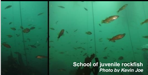
School of juvenile rockfish

North Central California Marine Protected Areas (MPAs), Established May 2010