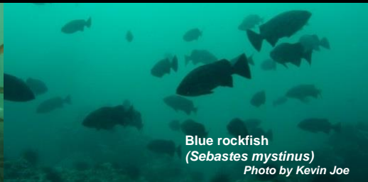
Blue rockfish ( Sebastes mystinus )