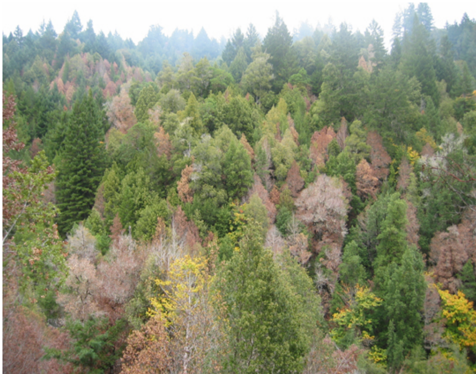
Tanoak mortality in Humboldt Co. circa 2006.

P. ramorum thrives in cool, wet climates. In California, coastal evergreen forests and tanoak/redwood forests within the fog belt are the primary habitat. For more information, visit www.suddenoakdeath.org