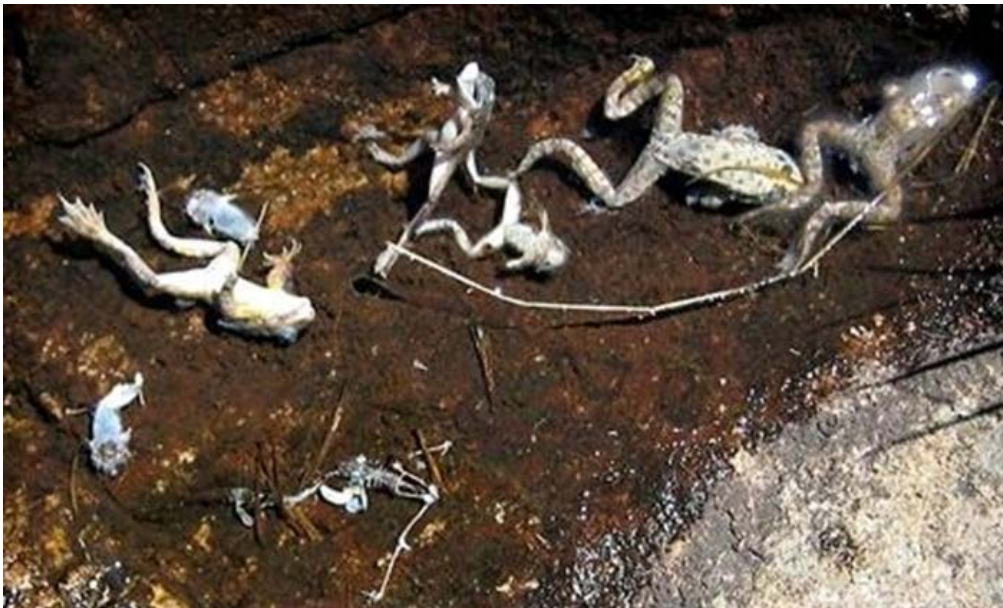
Effects of Chytrid fungus.