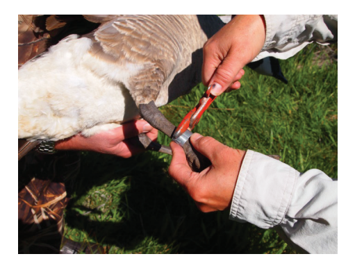
FIGURE 1. —Nearly 50,000 Canada geese have been banded in California since 1947.

An early effort to describe lesser snow goose wintering distribution in California, and in their northward spring migration, was conducted from 1954 to1955 (Kozlik et al. 1959). Three chemicals were used to temporarily dye a sample of geese (Figure 2) in an effort to determine how some individual geese used various habitats of the Central Valley, and what areas were visited in spring migration. These birds were sighted in spring and summer in eastern Oregon and Montana; Alberta and Yukon Territory, Canada; and in western Alaska. Rienecker (1965) expanded on the fall and spring distribution of lesser snow geese by analyzing recoveries of standard leg bands and documented two distinct migration routes between the breeding grounds and California.