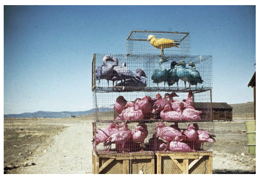
FIGURE 2.—Lesser snow geese color-marked with various dyes in an effort to determine local movements and migration routes (Kozlik et al. 1959).

The wintering distribution of Canada geese (B. c. moffitti) that nest and molt in northeastern California was also described by marking samples with uniquely numbered neck collars that were observed throughout the wintering period (Rienecker 1985a). With this technique, more information was used to describe wintering distribution than would be available through normal recoveries through bands encountered and reported by hunters. Additional studies using auxiliary markers deployed by Project personnel to describe distribution and other aspects of population ecology of geese included studies of cackling geese (Raveling and Zezulak 1992) and Aleutian Canada geese (B. c. leucopariea) (Woolington et al. 1979, Sanders and Trost 2013). Other neck collar marking projects with tule greater white-fronted geese (tule geese; Anser albifrons elgasi) by Project staff were used to describe population ecology on breeding areas in Alaska (Ely et al. 2006, Ely et al. 2007). Marking of tule geese with neck collars incorporating VHF radio transmitters and surgically implanted satellite transmitters (Figure 3) provided new insights to migration routes and stop-over areas across North America (Figure 4). Information from the VHF radio transmitters, combined with cooperative ground surveys, is currently used to estimate the population size (Yparraguirre and Weaver 2008) of the smallest population of any subspecies of geese in the world (Baldassarre 2014).