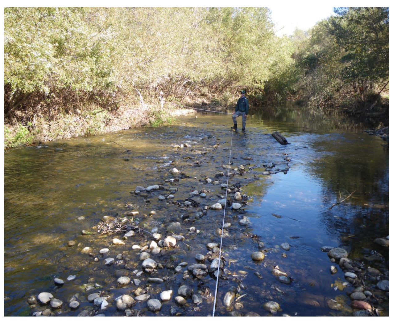
Figure 1. Example of a critical riffle transect that follows the shallowest course from bank to bank

Step 4: Determine the interval size at which to measure depth along the transect by considering the total transect width. Depth should be measured at a minimum of 20 intervals along the transect at small enough increments to accurately represent changes in bed profile elevation. A minimum sampling interval of one foot is recommended for CRA sites with critical riffles of greater than 20 ft from bank to bank. The sampling interval for CRA sites that are less than 20 ft from bank to bank should be adjusted so as to meet the 20 minimum depth measurements. Consultation with ODFW staff indicate more robust depth to flow relationships being achieved with approximately 50 depth measurements on the critical riffle (Tim Hardin, personal communication, July 2, 2012).