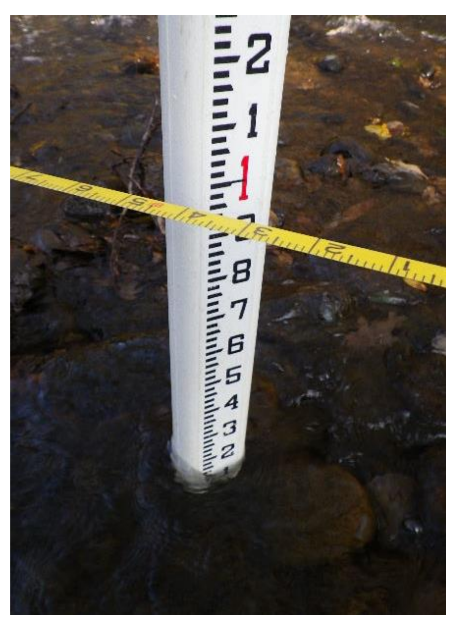
Figure 3. Detail: Using the stadia rod to measure depth along a critical riffle transect