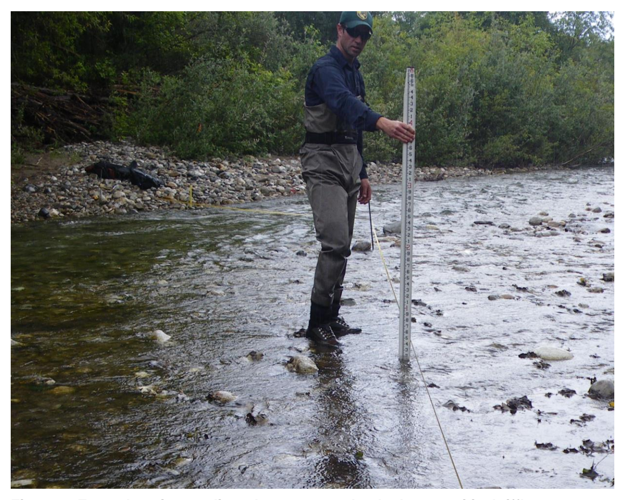
Figure 2. Example using stadia rod to measure depth along a critical riffle transect