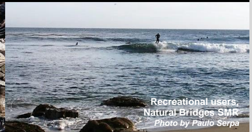
Recreational users, Natural Bridges SMR