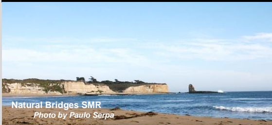
Natural Bridges SMR

Central California Marine Protected Areas (MPAs), Implemented September 2007