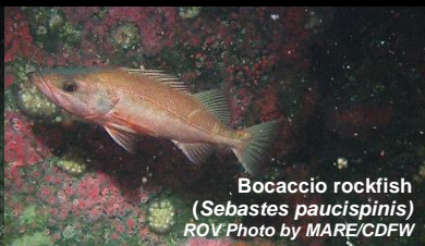
Bocaccio rockfish ( Sebastes paucispinis ) ROV Photo by MARE/CDFW