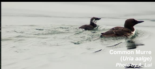
Common Murre ( Uria aalge )