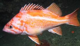
Canary rockfish ( Sebastes pinniger ) ROV Photo by MARE/CDFW

Central California Marine Protected Areas (MPAs), Established September 2007