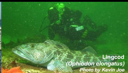
Lingcod ( Ophiodon elongatus )