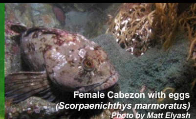
Female Cabezon with eggs ( Scorpaenichthys marmoratus )