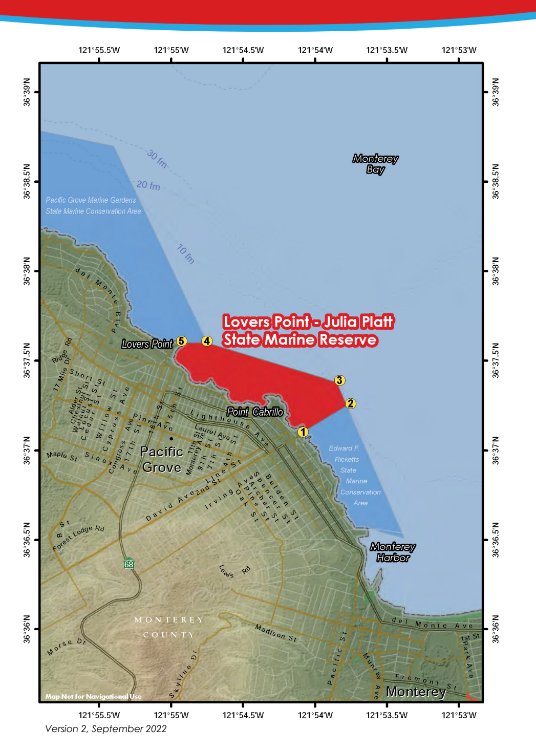
Lovers Point - Julia Platt State Marine Reserve Boundary and Regulations from California Code of Regulations Title 14, Section 632