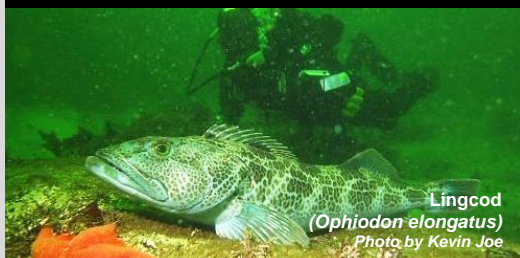
Lingcod ( Ophiodon elongatus )

Central California Marine Protected Areas (MPAs), Established September 2007