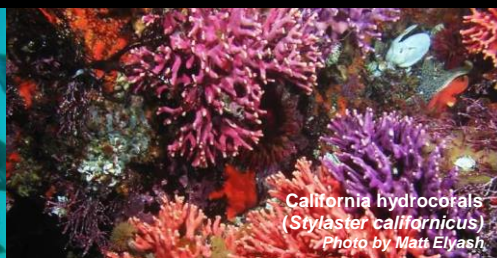
California hydrocotyls ( Stylaster californicus )