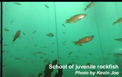
School of juvenile rockfish