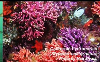
California hydrocorals ( Stylaster californicus )