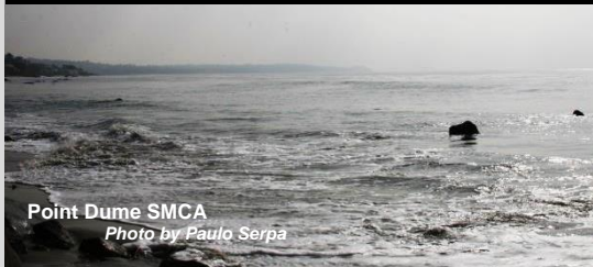
Point Dume SMCA

Southern California Marine Protected Areas (MPAs), Established January 2012