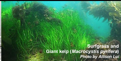
Surfgrass and Giant kelp ( Macrocystis pyrifera)