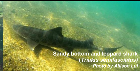
Sandy bottom and leopard shark ( Triakis semifasciatus)