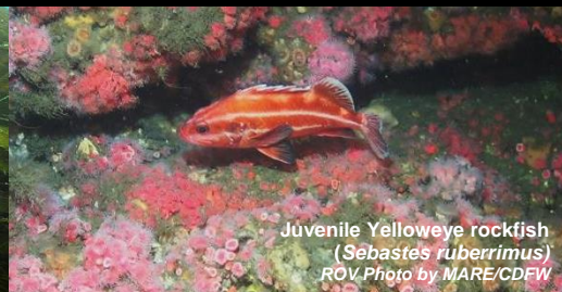
Juvenile Yelloweye rockfish ( Sebastes ruberrimus ) ROV