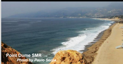
Point Dume SMR

Southern California Marine Protected Areas (MPAs), Established January 2012