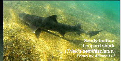
Sandy bottom Leopard shark ( Triakis semifasciatus)