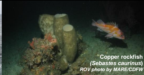
Copper rockfish ( Sebastes caurinus )