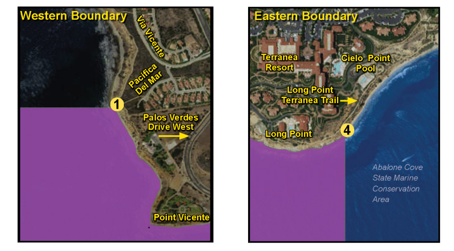
Take may be authorized for research, restoration, and monitoring purposes under a scientific collecting permit. See California Code of Regulations Title 14, Section 632(a).

a. Take pursuant to remediation activities associated with the Palos Verdes Shelf Operable Unit of the Montrose Chemical Superfund Site is allowed inside the conservation area pursuant to the Interim Record of Decision issued by the United States Environmental Protection Agency and any subsequent Records of Decision.