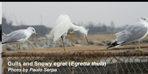
Gulls and Snowy egret ( Egretta thula )