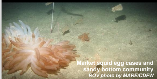
Market squid egg cases and sandy bottom community ROV photo by MARE/CDFW

Southern California Marine Protected Areas (MPAs), Established January 2012