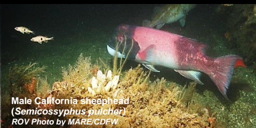
Male California sheephead ( Semicossyphus pulcher ) ROV Photo by MARE/CDFW