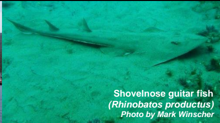
Shovelnose guitar fish ( Rhinochimaera productus )