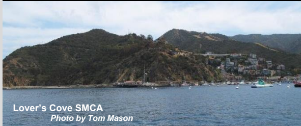
Lover's Cove SMCA

Southern California Marine Protected Areas (MPAs), Established January 2012