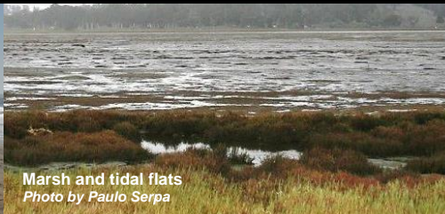
Marsh and tidal flats