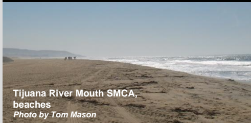
Tijuana River Mouth SMCA, beaches

Southern California Marine Protected Areas (MPAs), Established January 2012