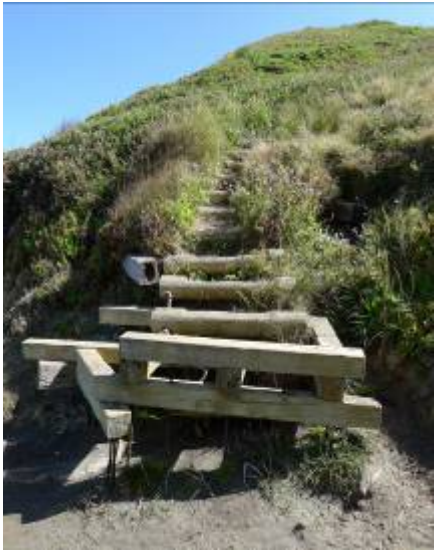
South Rodeo Beach access

These 26 projects have been selected for awards by the state Trustees. They are located in the East Bay, Marin County, San Mateo County, and other locations not covered by the National Park Service.