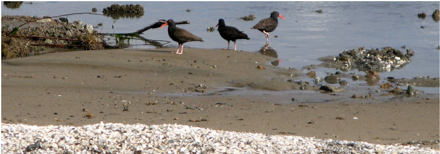
Black Oystercatchers enjoy a remodeled beach on Aramburu Island.