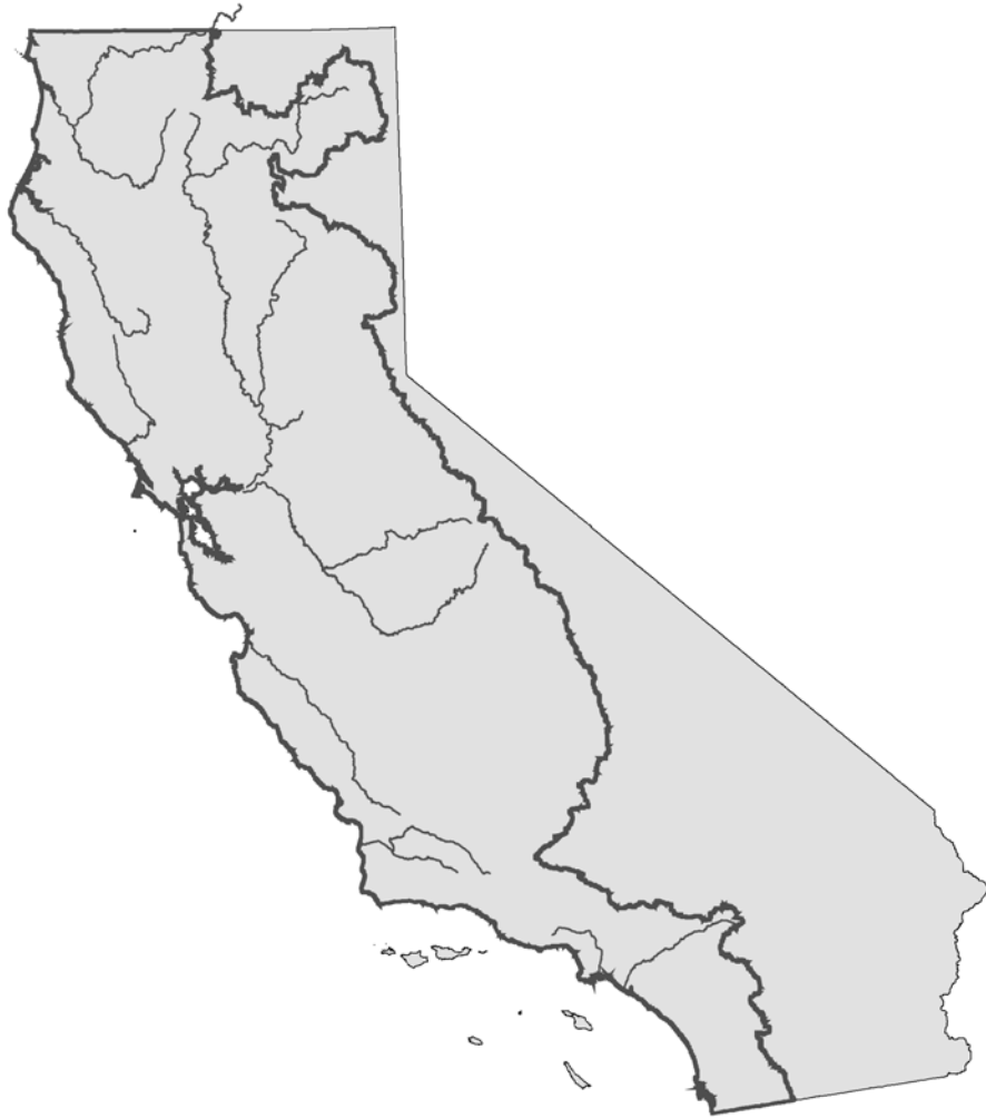
Figure 1. Outline of anadromous fish passage study area within California for which dam locations were assessed. Study area encompassed all rivers that empty into the ocean within California.