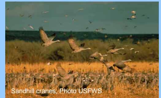
Sandhill cranes