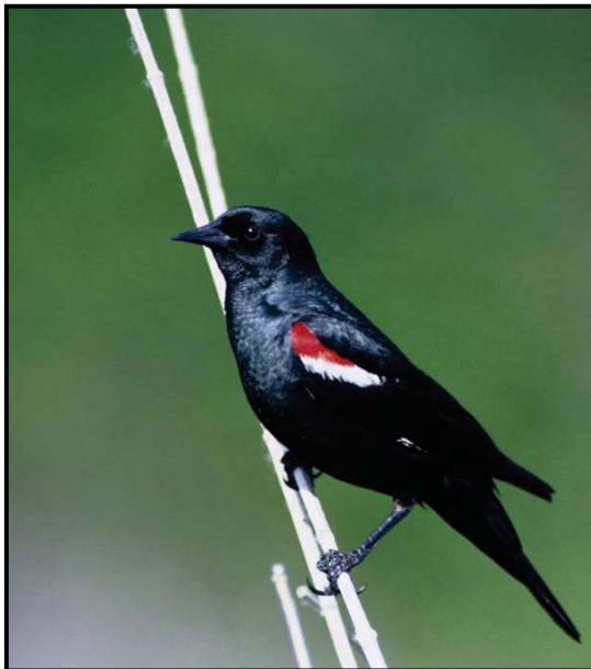
Tricolored blackbird, Photo USFWS

The California Landowner Incentive Program (LIP) is an effort to reverse the decline of special status species in the Central Valley of California through the enhancement and management of private lands.