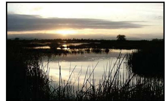
Semi-permanent wetland

LIP will assist with the implementation of these practices by providing participating landowners with annual incentive payments in return for implementing habitat management efforts designed to benefit special status species.