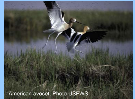
American avocet