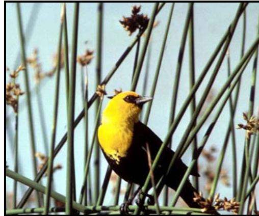
Yellow-headed blackbird