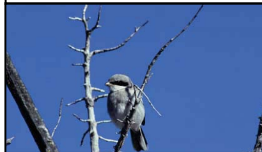
Loggerhead shrike